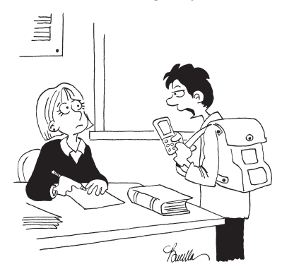
"A thousand word report? How many words is that in text message?"